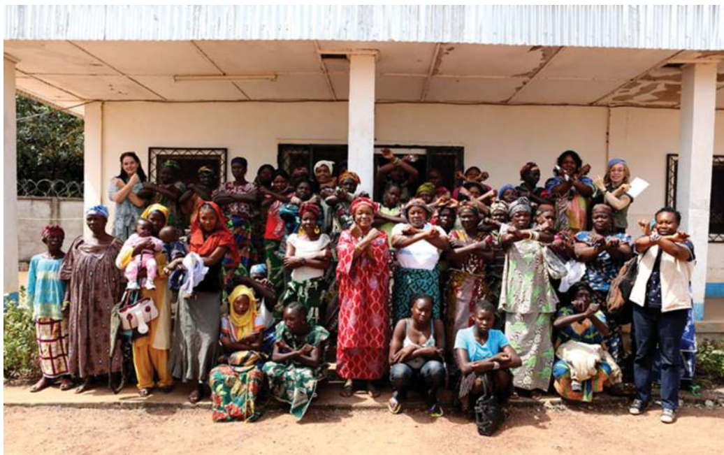
A women's group in Central African Republic joins UN Special Representative on Sexual Violence in Conflict, Zainab Hawa Bangura, in the 'stop rape in war' campaign.