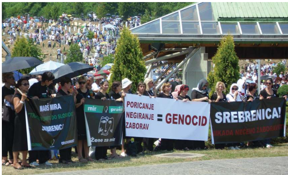
Members of Women in Black, a peace and justice organization, attend a memorial service, held every year in Srebrenica, Bosnia-Herzegovina, July 2011.