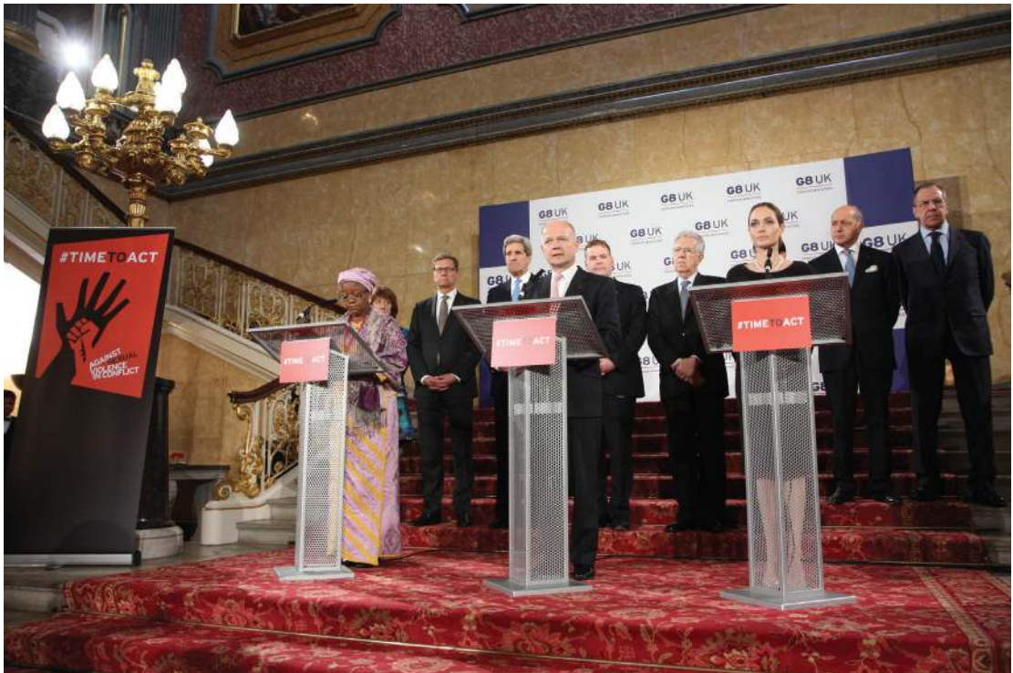
Launch of G8 Declaration on Preventing Sexual Violence in Conflict with UK Foreign Secretary William Hague, Special Representative of the UN Secretary General on Sexual Violence in Conflict, Zainab Hawa Bangura and Special Envoy of UN High Commissioner for Refugees Angelina Jolie, April 2013.