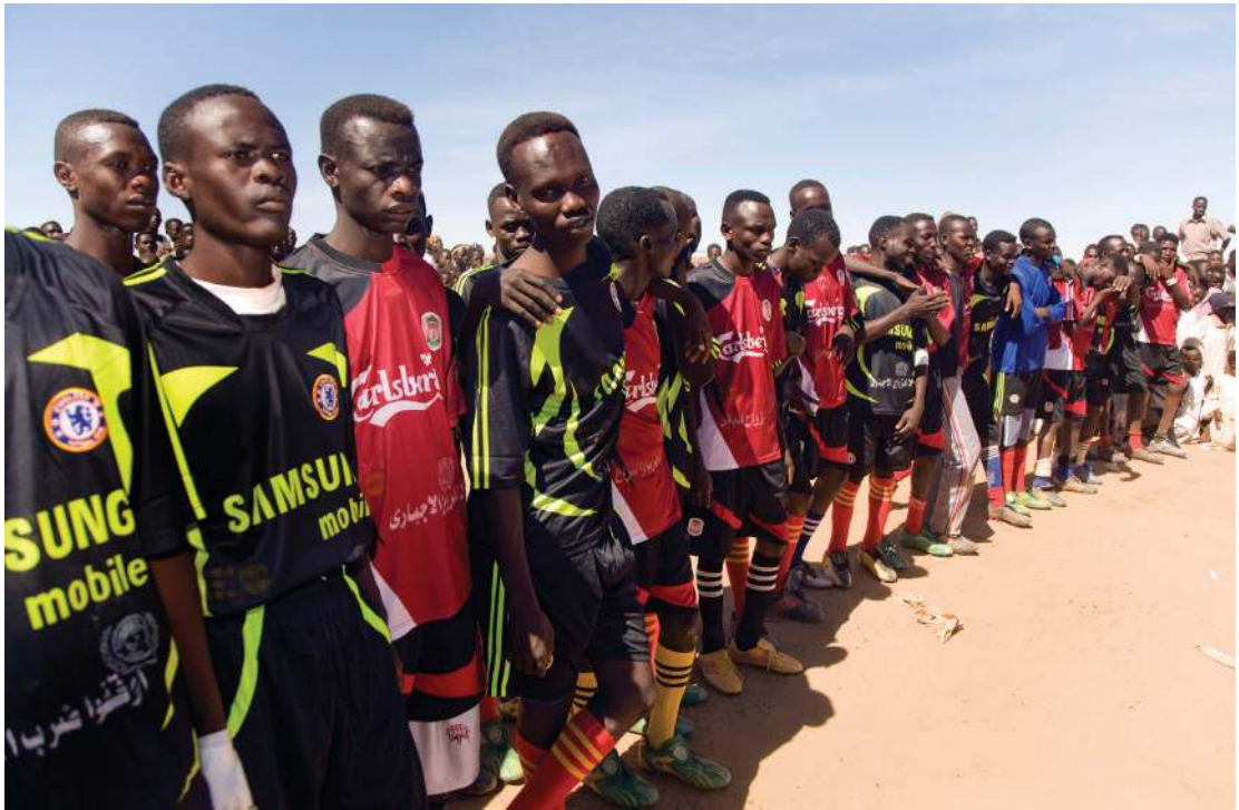
Sudanese football teams play football as part of campaign 'We Can End Violence Against Women', organised by African Union-United Nations Hybrid Operation in Darfur (UNAMID) and the United Nations Population Fund (UNFPA), Abu Shouk Internally Displaced Persons Camp, North Darfur, 2009.