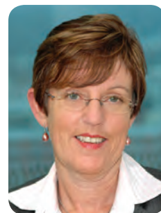
Hon Daniel Andrews MP Minister for Health